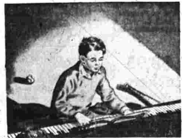
Music for a boy

by the applicants for various reasons of changing conditions or work. May Mean Two Meetings —Petitioners own the Memorial Field issue, who have asked for a special town meeting. It was that question, may, must that their petition precludes the inclusion of any other question at that particular session. This might result in two special meetings instead of one. Strictly on the record, the only tabling action was taken in regard to Memorial Field. The second petition, on housing, was not actually tabled, but was referred to the town clerk for completing action.